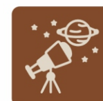
Star Gazing Area